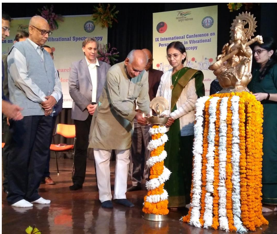
Photo 2: Prof V K Rastogi lighting the lamp on Dec 13, 2022 during the inaugural session of ICOPVS-2022.